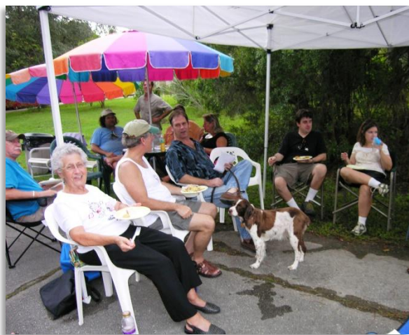
La France Neighbors Gathering Block Party

[For example], two doors door down there's a neighbor who wife recently got a job. She was unemployed for a while until recently, which meant she had to leave her husband who's handicapped at home. And he just needed help getting to doctors appointments, you know, getting around.