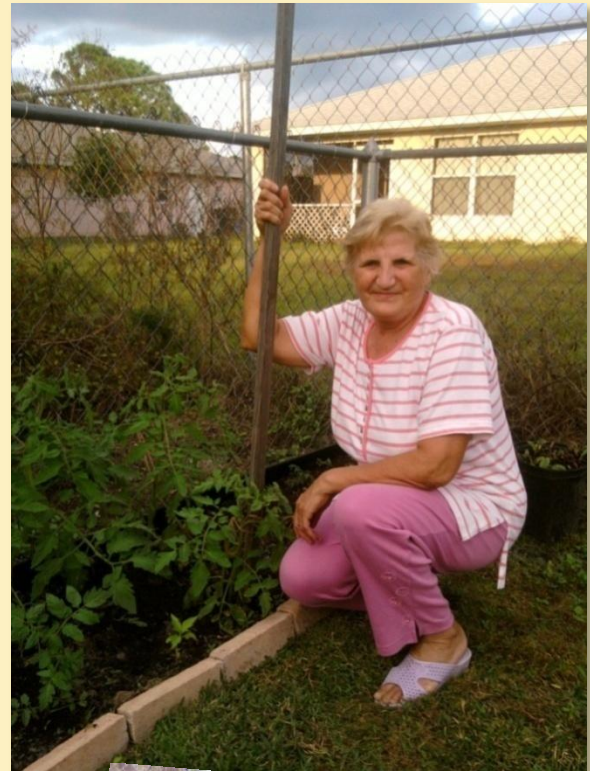
Zaga's healthy Tomato plant